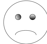
NOT NORMAL (Eye Exam Soon)